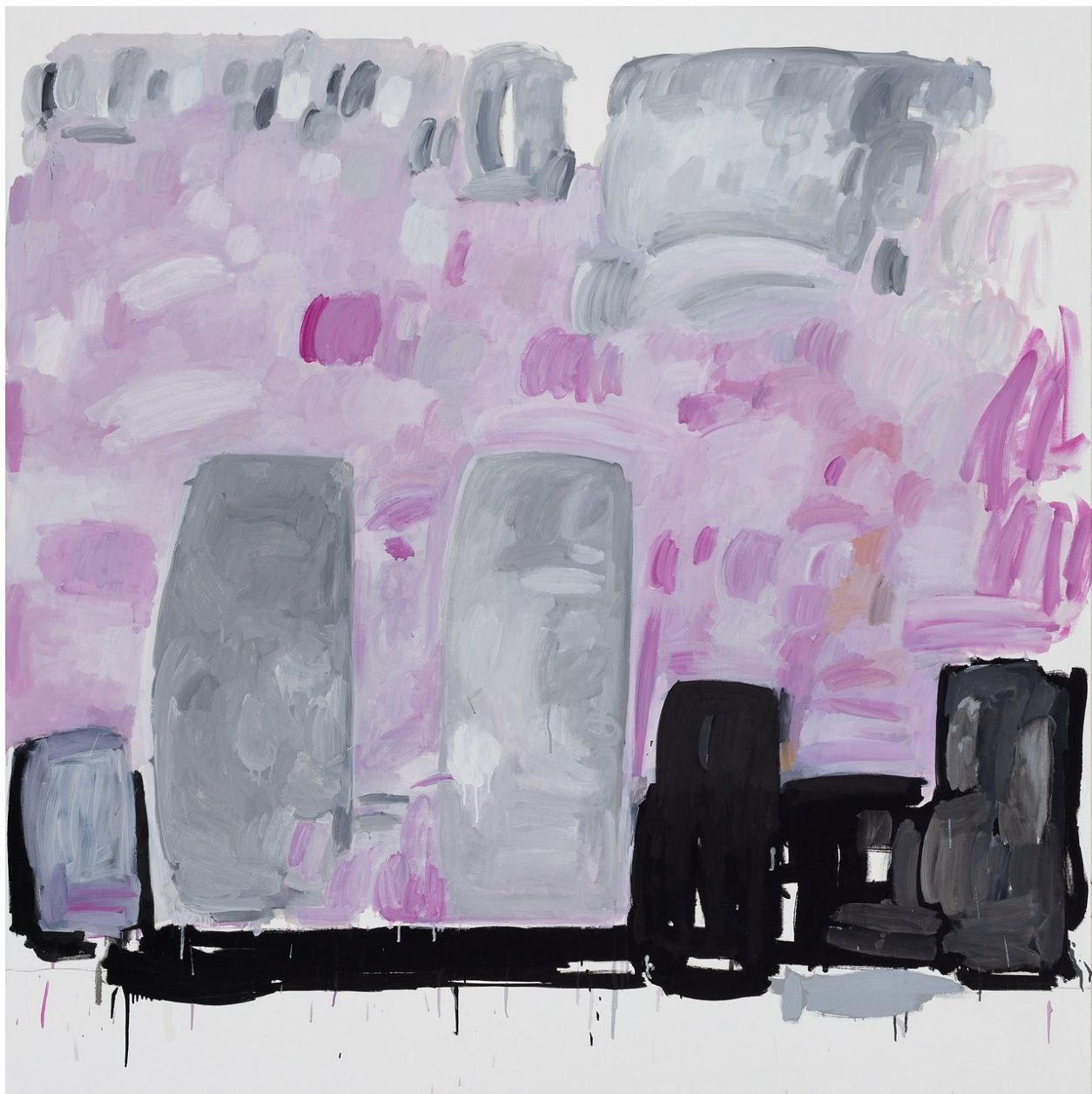
Margaret Lee IPB.02 , 2022 oil on linen 68" x 68" x 2"