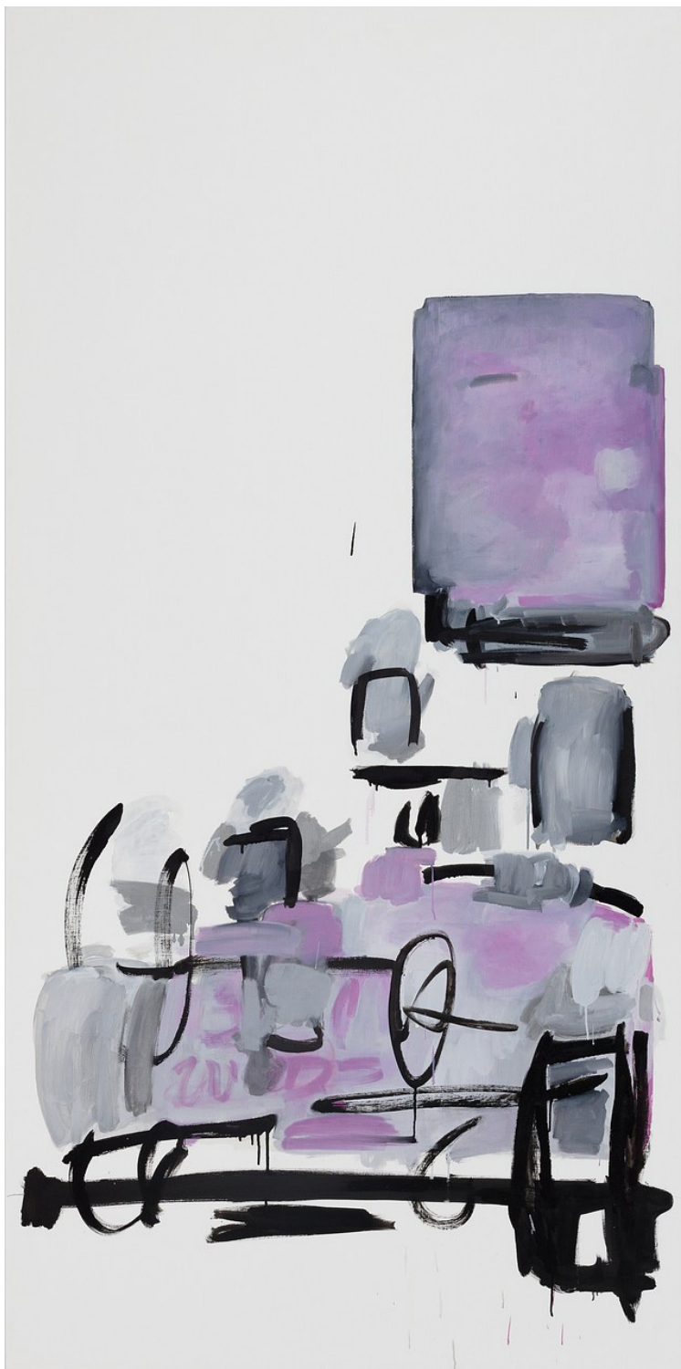
Margaret Lee IPB.11 , 2022 oil on linen 68" x 34" x 2"