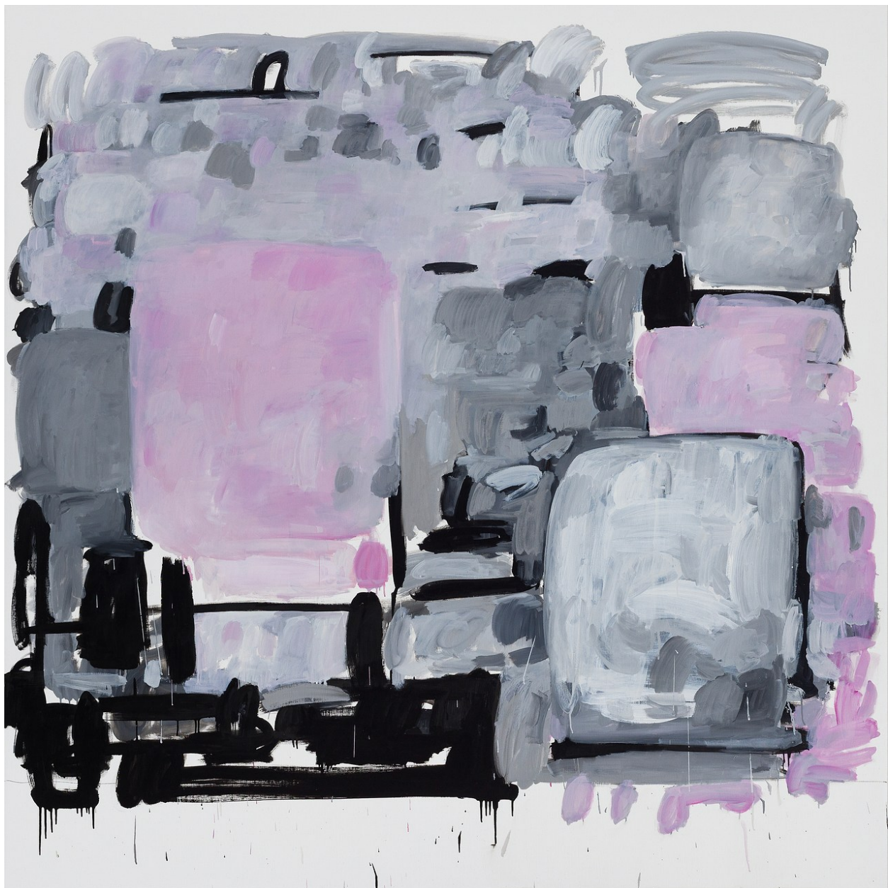
Margaret Lee IPB.04 , 2022 oil on linen 68" x 68" x 2"