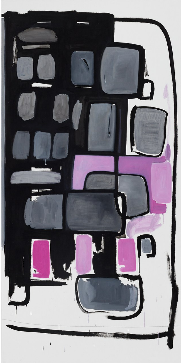
Margaret Lee IPB.17 , 2022 oil on linen 68" x 34" x 2"