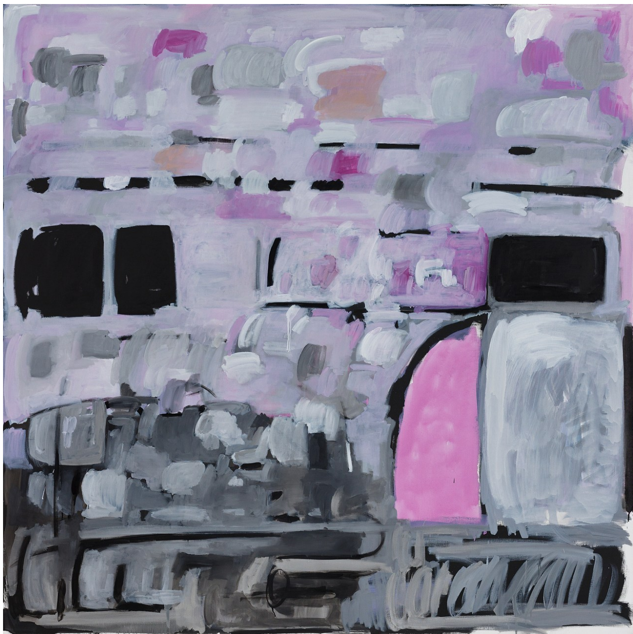
Margaret Lee IPB.05 , 2022 oil on linen 68" x 68" x 2"