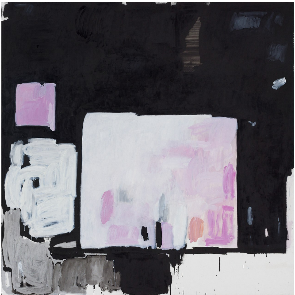
Margaret Lee IPB.01 , 2022 oil on linen 68" x 68" x 2"