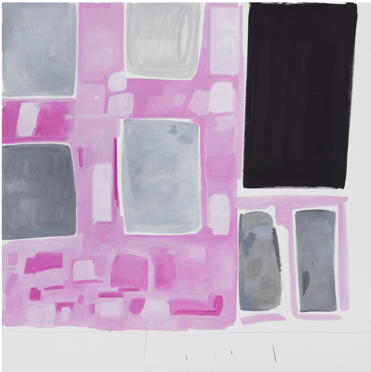
Margaret Lee IPB.09 , 2022 oil on linen 68" x 68" x 2"