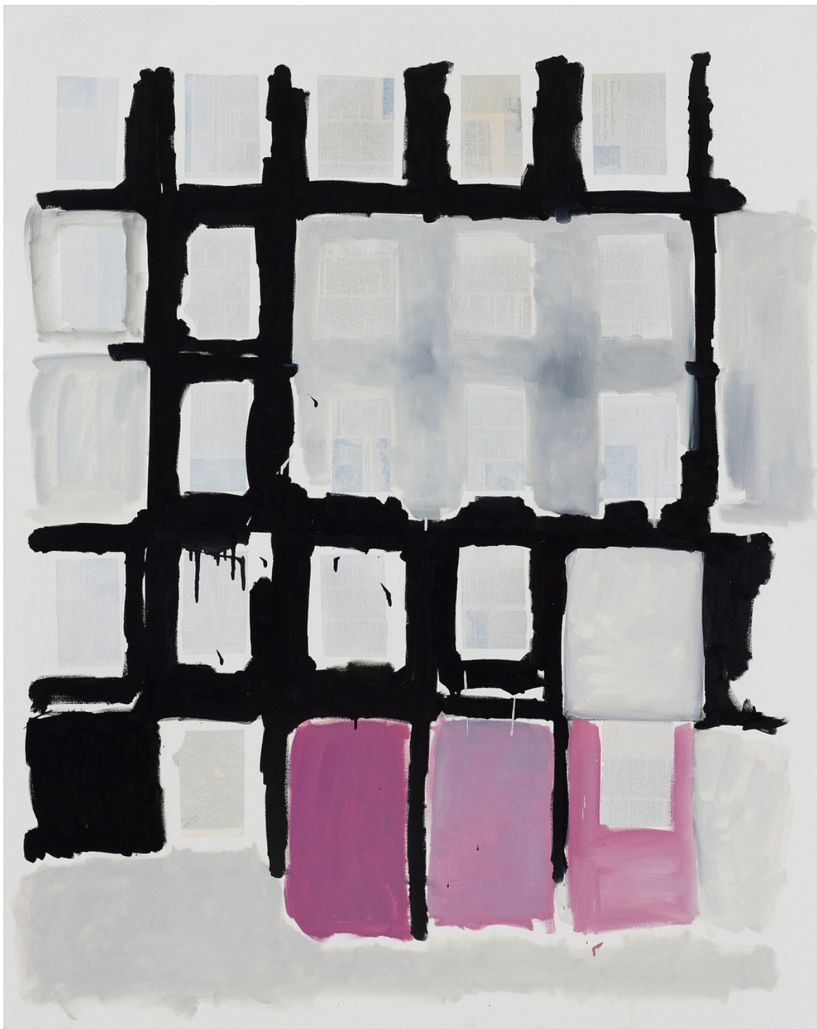
Margaret Lee P,B,G. 02 , 2020 Oil paint and newspaper on canvas 48" x 60" x 1.5"