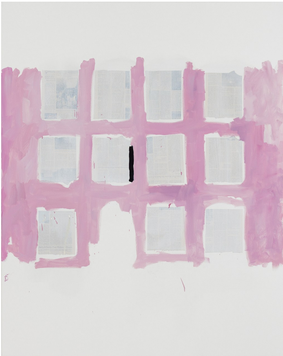
Margaret Lee P,B,G. 03 , 2020 Oil paint and newspaper on canvas 48" x 60" x 1.5"