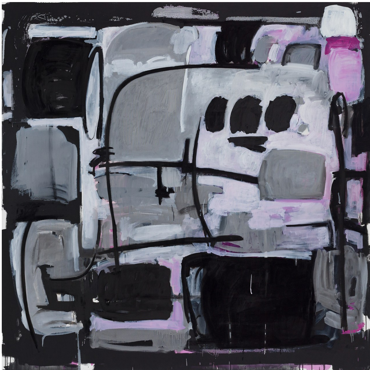
Margaret Lee IPB.03 , 2022 oil on linen 68" x 68" x 2"