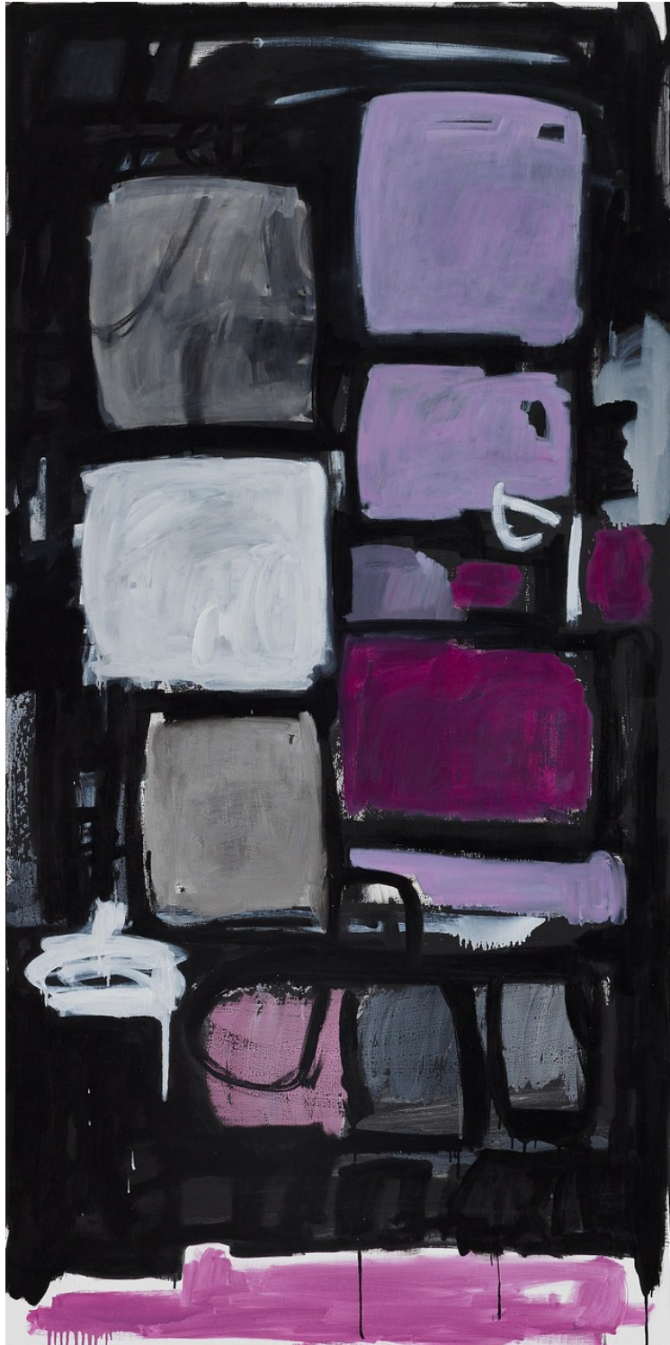
Margaret Lee IPB.06 , 2022 oil on linen 68" x 34" x 2"