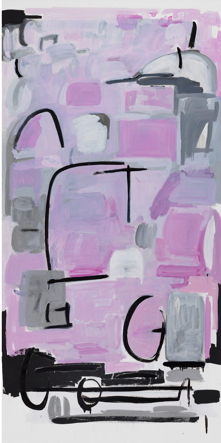
Margaret Lee IPB.07 , 2022 oil on linen 68" x 34" x 2"