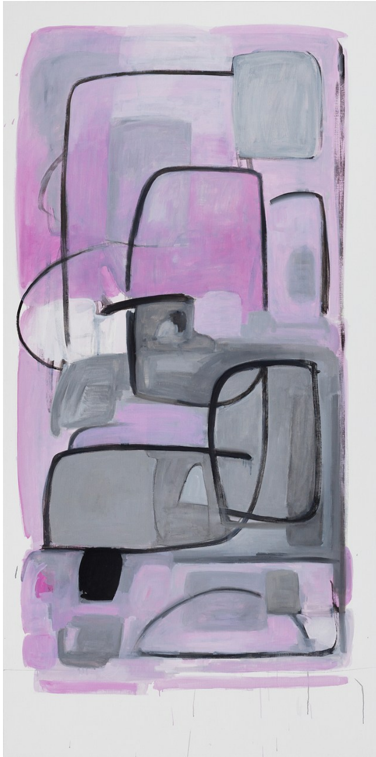
Margaret Lee IPB.08 , 2022 oil on linen 68" x 34" x 2"