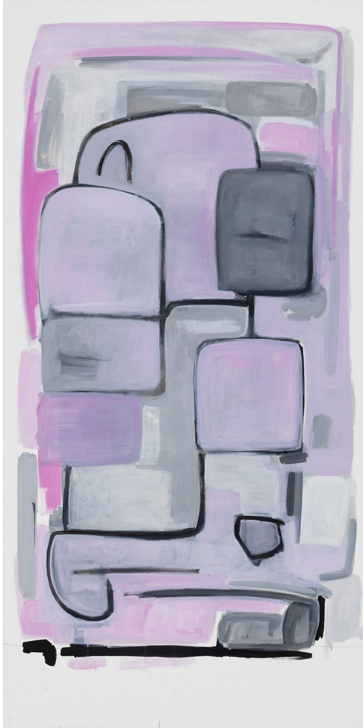
Margaret Lee IPB.13 , 2022 oil on linen 68" x 34" x 2"