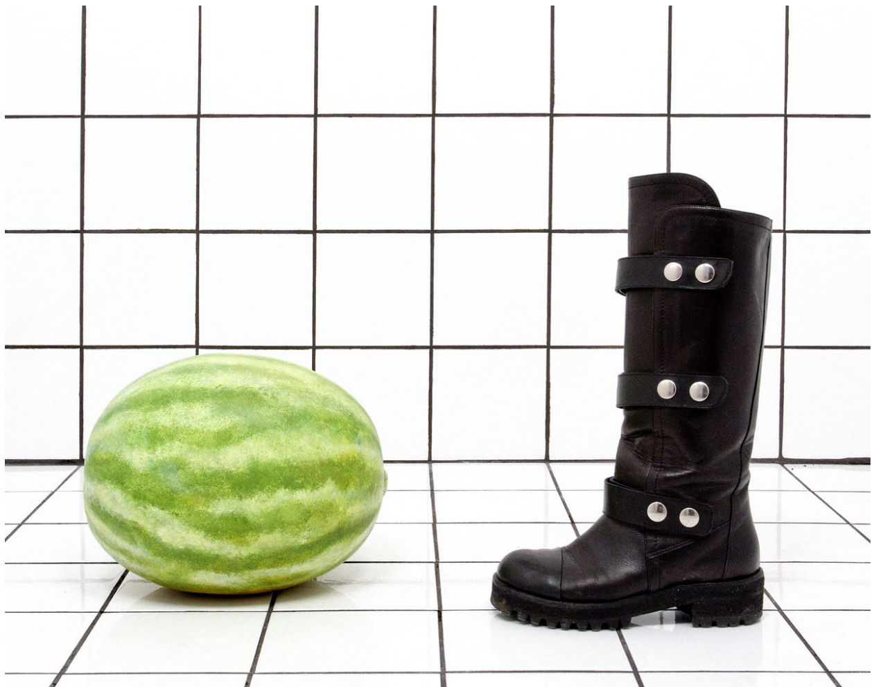
Margaret Lee Watermelon Boot (anticipation or something) , 2011 Archival Pigment Print 12 x 24 in edition of 5