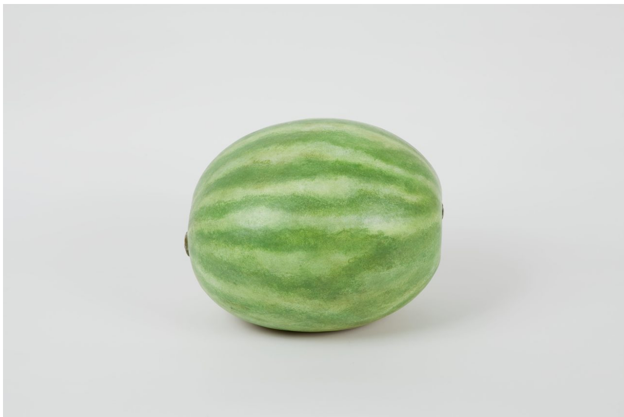
Margaret Lee Watermelon (putting your mind on it) , 2011 Plaster and acrylic paint 5 in the series