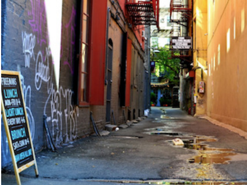
Even the “unmarked,” alleyway entrance to Freemans felt sunny...